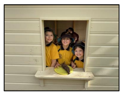
New Cubby House in the playground.