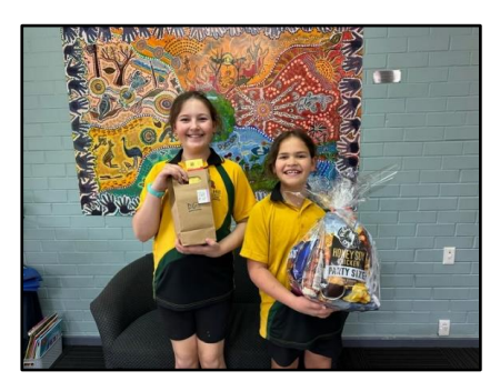
P&C Father's Day Raffle winners

Good luck to all our competitors in the Interschool Carnival in Week 9! Thank you to the P&C over the past weeks who have conducted sausage sizzles, bake stalls and Father's Day stall and raffle. They have raised more funds that will go directly to the school. Thank you!