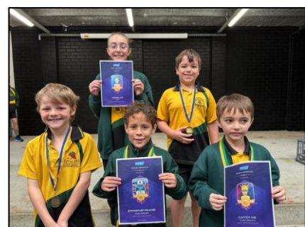
Maths Award winners