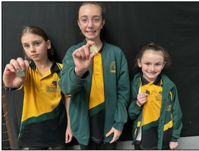
Running Club Badges