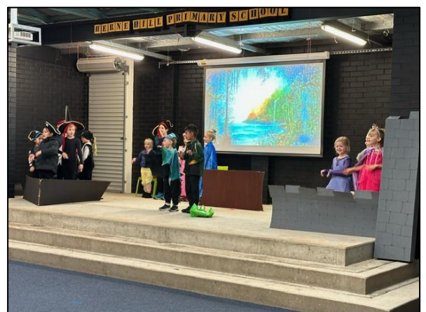
Year 1 performing at the assembly on 25 th July.

Well done to our Year 1 students who conducted the assembly on Thursday 25 th July. They performed a short play on Puff the Magic Dragon. The costumes were terrific, and I was most impressed with the speakers at the assembly. Well done everyone. Our next assembly is on Thursday 8 th August and it will be conducted by Year 4.