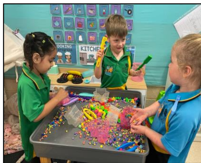
Our 2024 Kindy Students