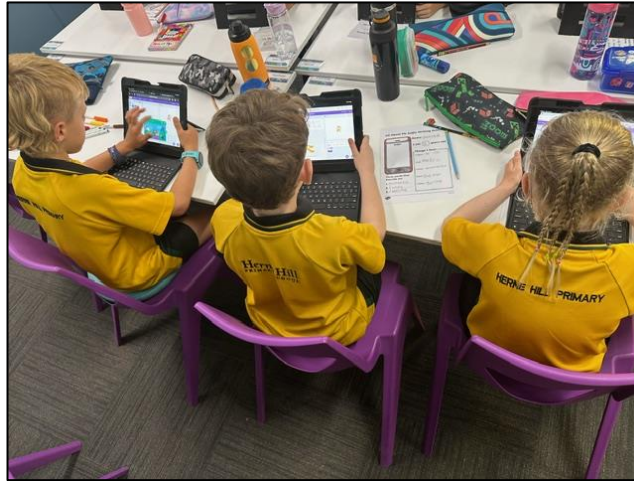
iPads in the Classroom

Unfortunately, the P&C were unable to form a committee and hold the meeting last week. Another meeting is scheduled for Monday 26 th February at 6pm in the Staff Room. All executive positions have been filled except for Secretary – there were no nominations. The P&C needs to fill all executive positions to have a committee. The P&C provide great support for the students at the school. Without their fundraising efforts the school would not have had subsidised excursions, swimming lessons, resources purchased and recently 10 x iPads were purchased for the school. If you are able to volunteer on the P & C, please come down on Monday and become a member of the P&C. To join it is just a gold coin.