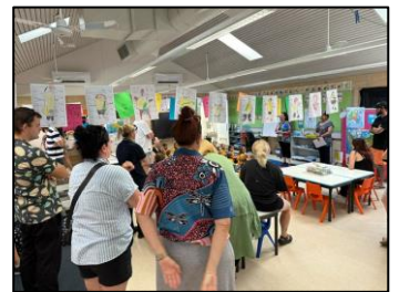
Pre-Primary information session